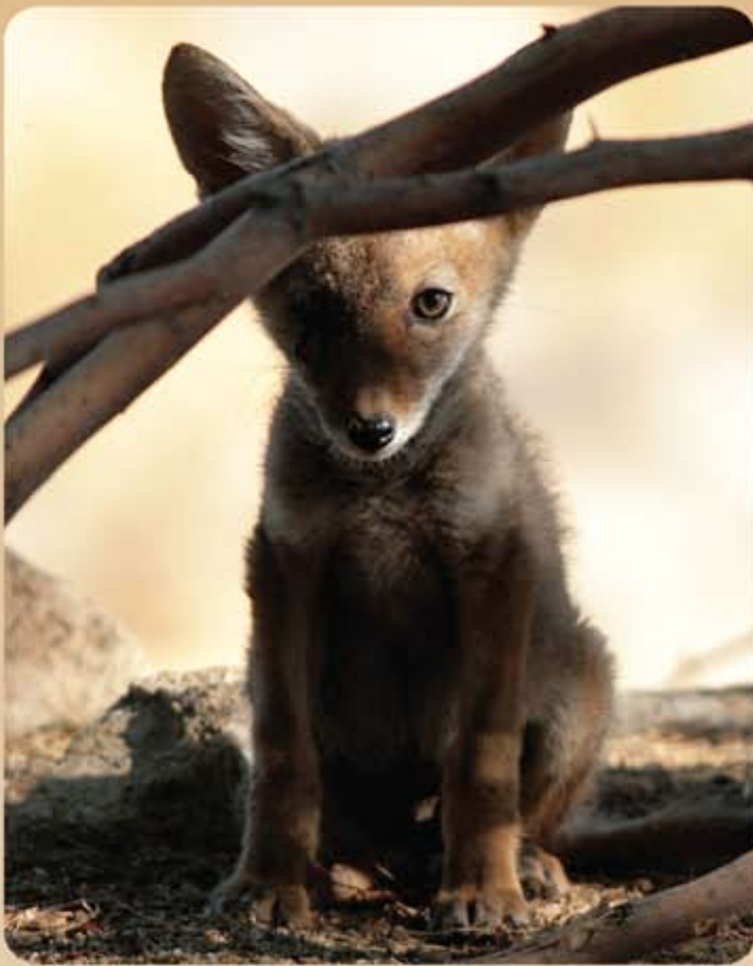
Adopt a Quail Mountain Animal:

The legacy of land, water, and wildlife.