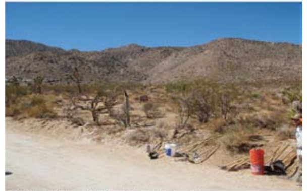
2. Restoration point #1 along Sunset Road after restoration.