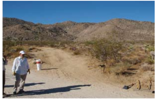
1. Restoration point #1 along Sunset Road before restoration.