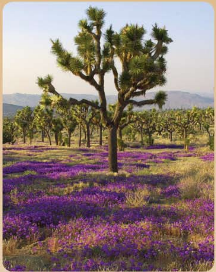
Adopt a Quail Mountain Acre: